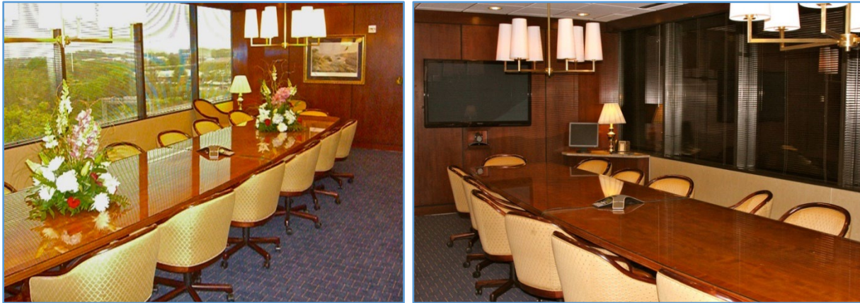
Conference Room 3

of divorce, equitable distribution and property and separation agreements. Sanderson has also continued the Firm's tradition of public service. 47